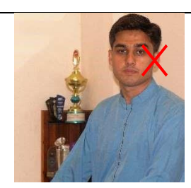
Background or scenery